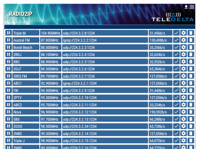
Above: Example of the versatile x2IP Multichannel Stream Encoding platform

For more information please contact your local distributor or sales@teledelta.com