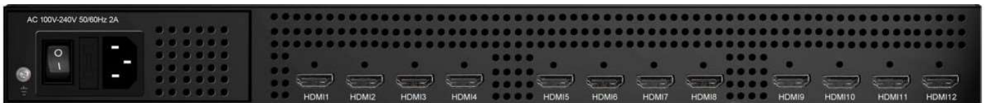
HDS2804-HDMI-12 Back panel shown above