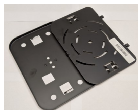
HD1100-R-BRAC (Roof Mounting Bracket)