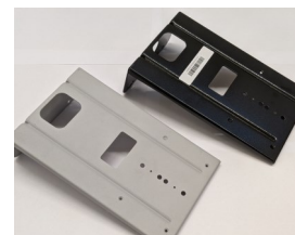
HD1100-W-BRAC (Wall Mounting Bracket)