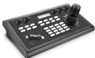
HD1100-C-IP (IP and Serial PTZ Camera Controller)